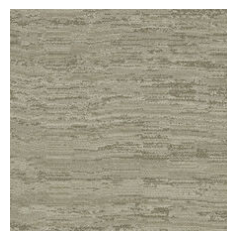
Element 33506 LRV 18.6